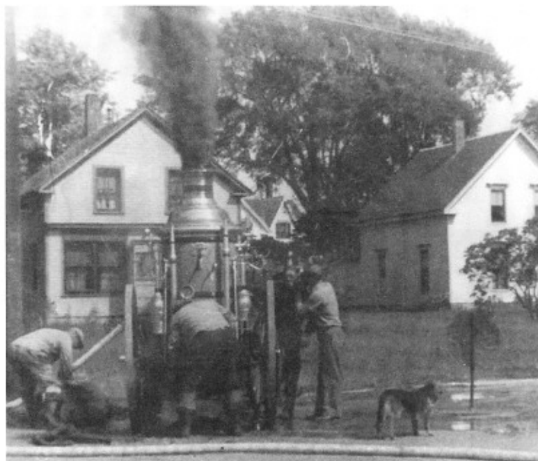
Steam engine Reuben Carver pumping water.